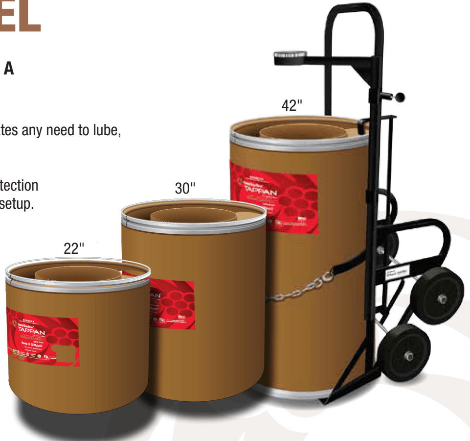
The 42" barrel is featured with SIMpull BARREL™ Hand Truck, Model #SBT01