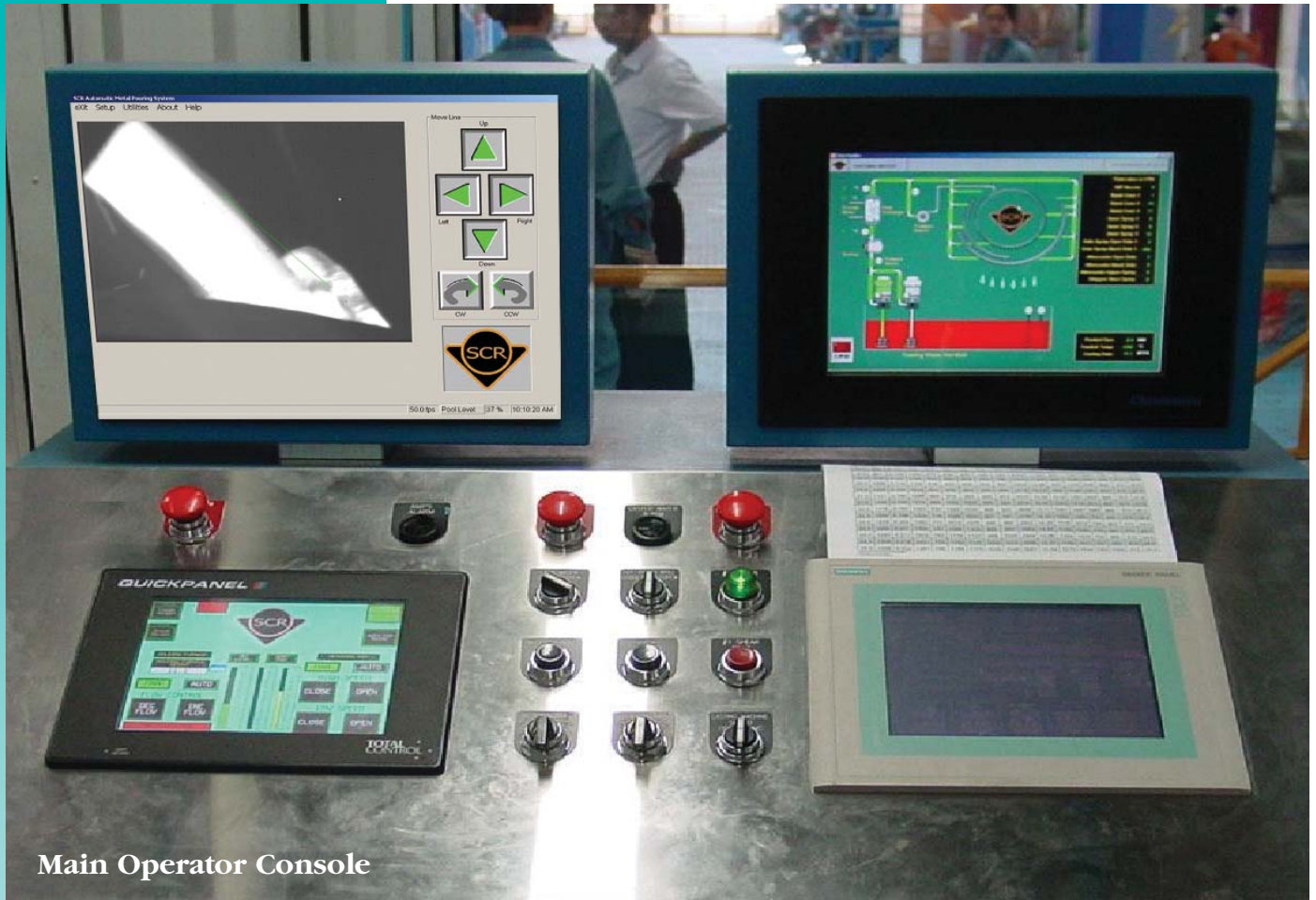
Main Operator Console